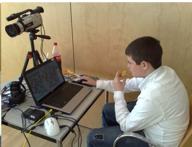
Commenting in KGS for Euro Go TV