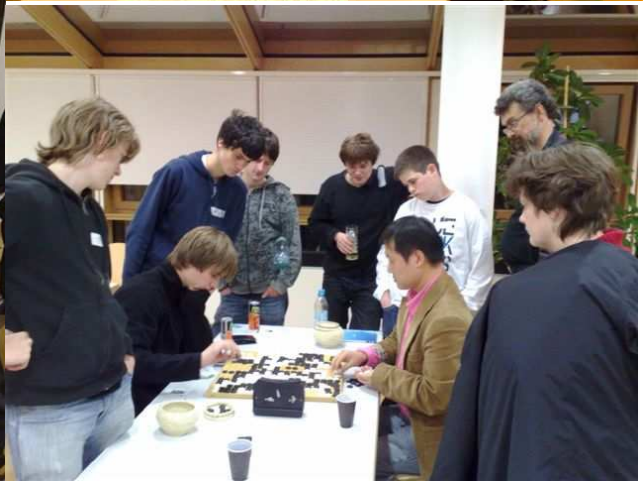
Round 7 21.11.2010 watching results and pairing