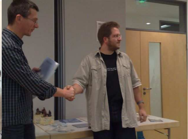
The youngest participant