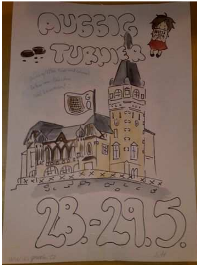
Advertisement to coming tournament in Czech Republic