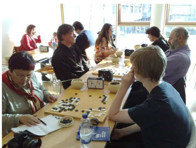
Round 8 (last round)