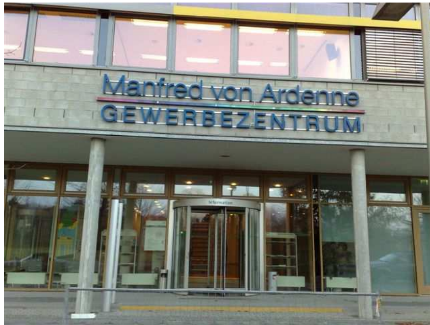
The venue at Innovation Park