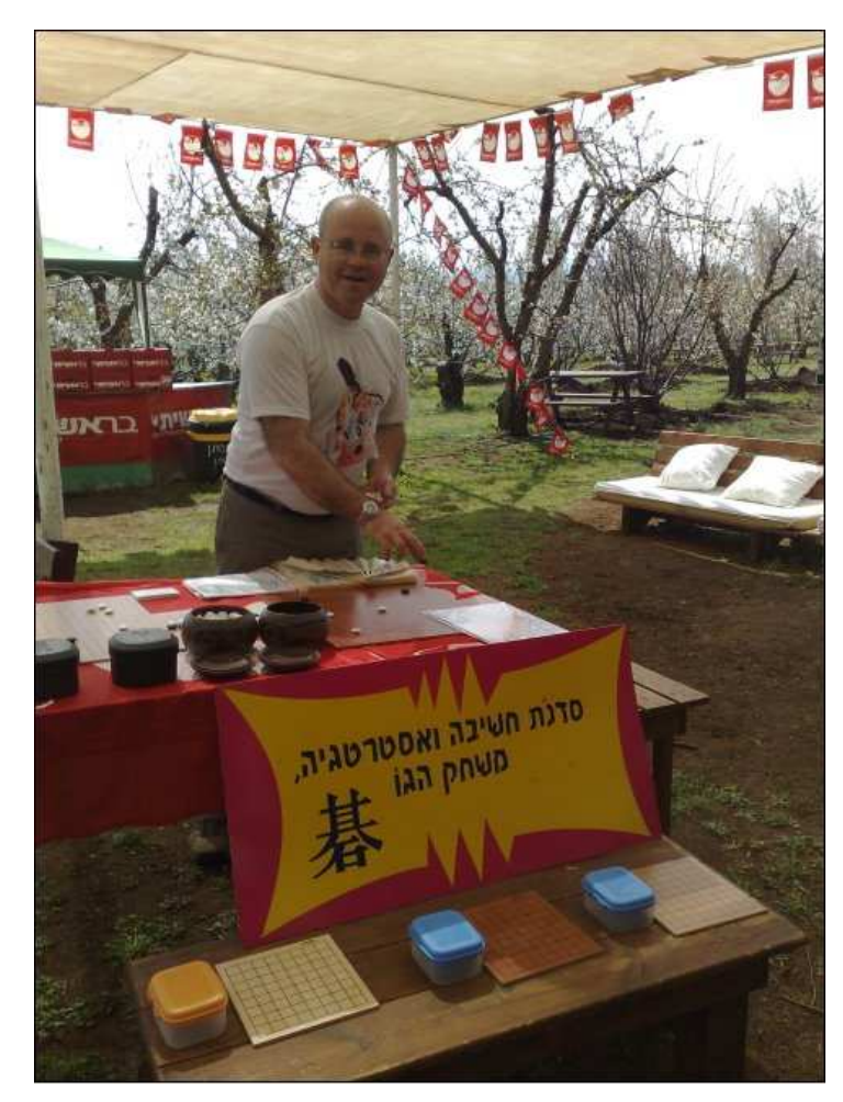
For further information, finding Go club or activity - visit our website and Forum.