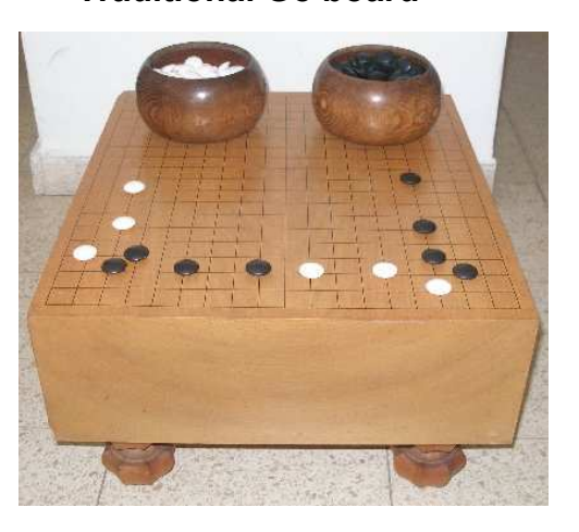
Table Go board